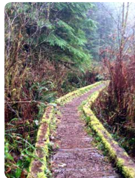
Redwood National Park hiking trail