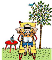
Spend Time With Dad DAY

June 17, 2018— Father's Day NO YOUTH GROUP